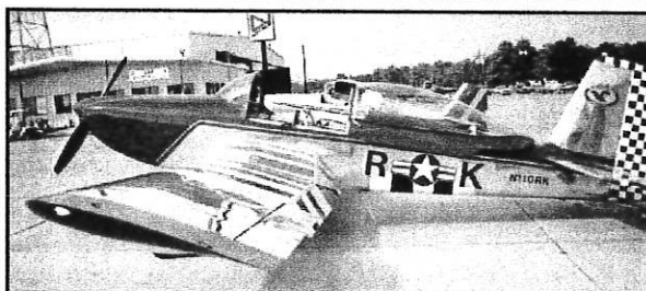
Dick Kardell's shiny new RV-8 is looking good.