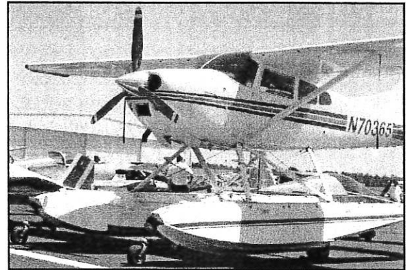
above: Winner, tallest Cessna award.