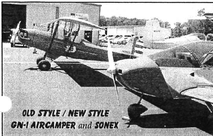
OLD STYLE / NEW STYLE GN-1 AIRCAMPER and SONEX