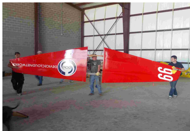
Second wing to load