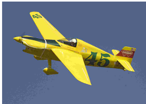
Quadnickel in the air