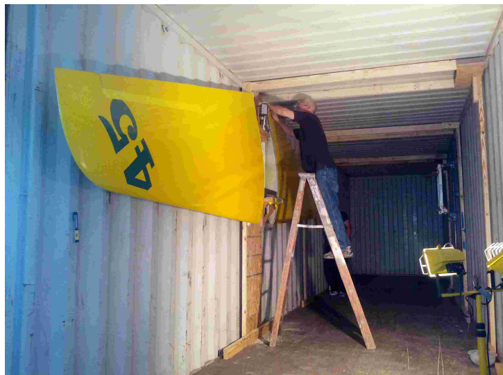
Jay secures the first wing