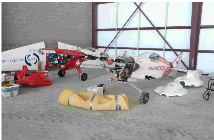
Parts & planes EVERYWHERE!