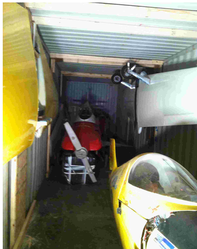
3 aircraft easily fit with room for everything else