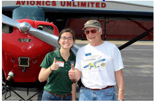
Chuck gets a break on the weather