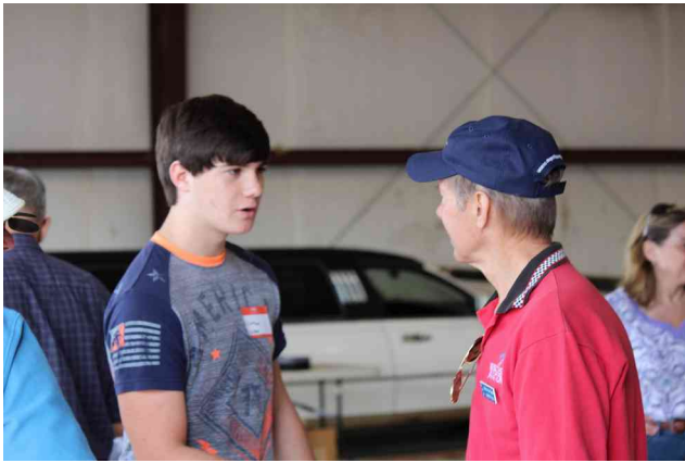
Shuttle Commander good enuf for ya?