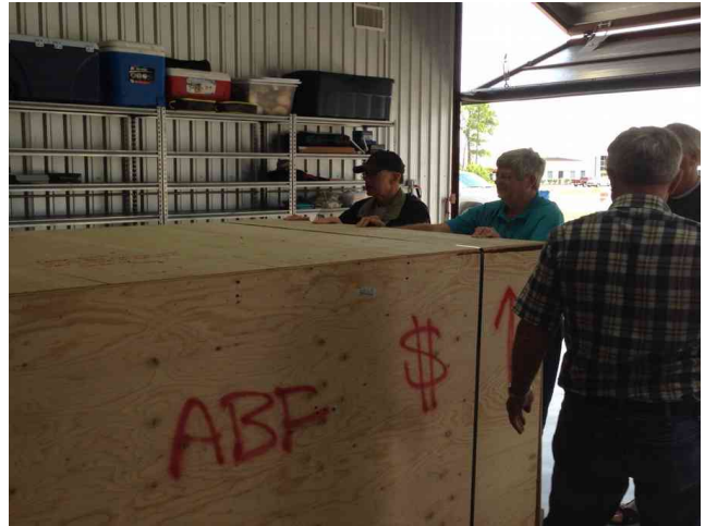
Now safely in the hangar