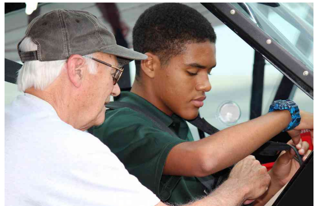
Nice Job "Droughtbuster"! Thanks