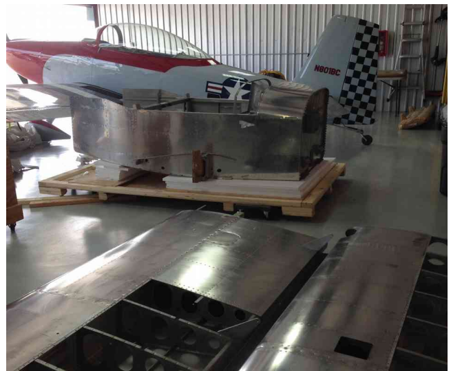
All unpacked—some assembly required