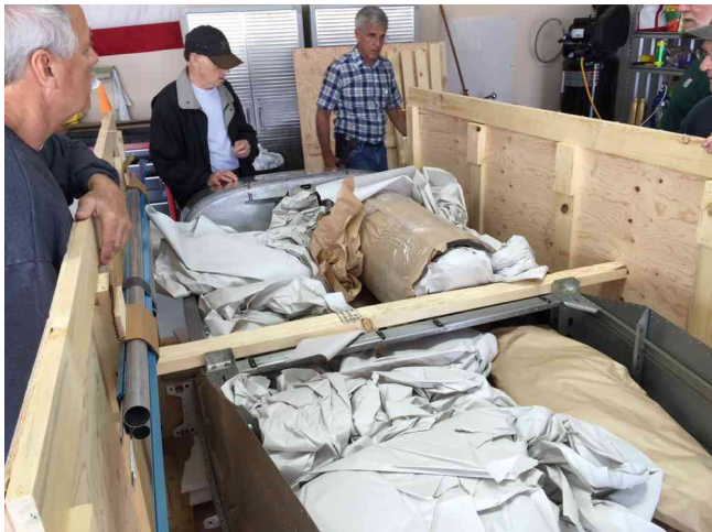
Where does all this stuff go??