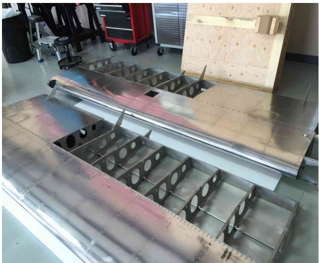
Wings finally uncrated—enough wood for a house