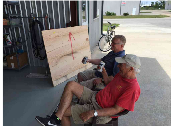
Never any shortage of adult supervision!