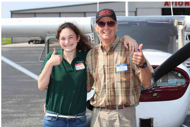
Hmmm...not sure. YPP violation?