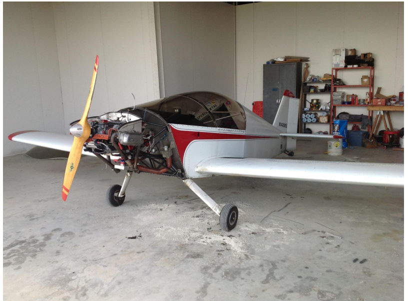
Mike Singleton's Sonex almost ready for the trip up to Oshkosh.