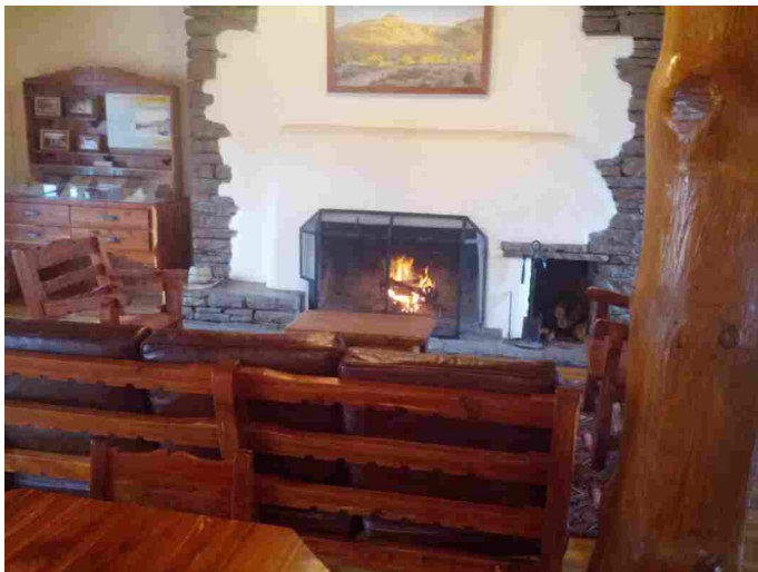
Indian Lodge Lobby