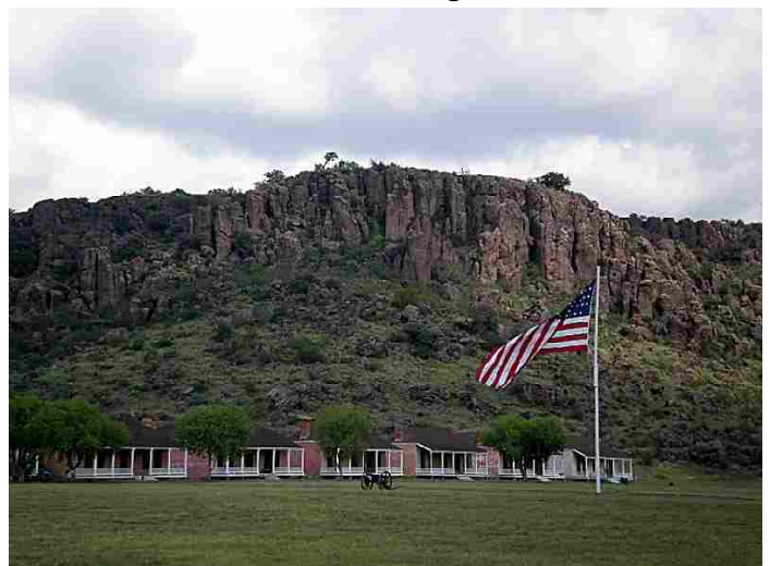
Fort Davis Parade Grounds