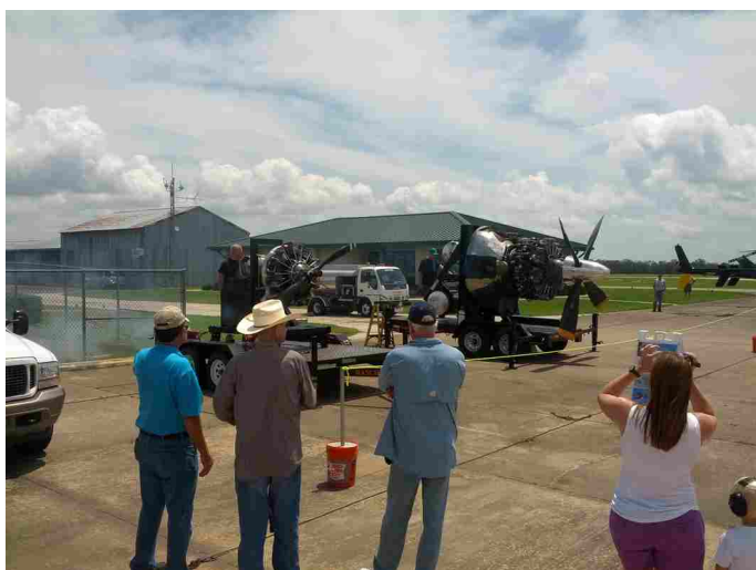
Live Radial Engine-Runs

As you can see from the clouds, it was a perfect summer day for some rain-free fun.