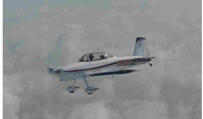
Denny&Gwen over scattered clouds