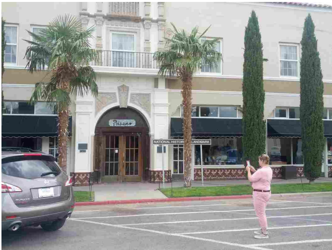
Marfa's Paisano Hotel Where "Giant" was filmed