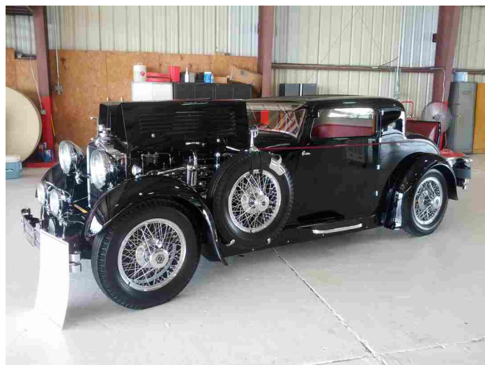
A Stutz worth more than most planes