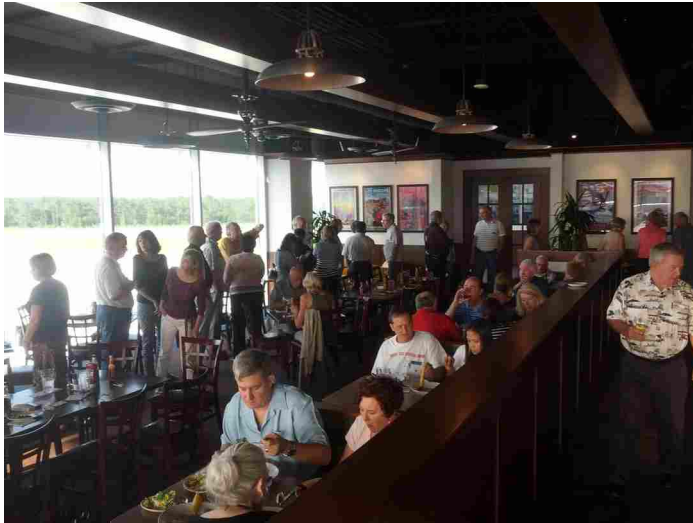
Guests line up for the buffet