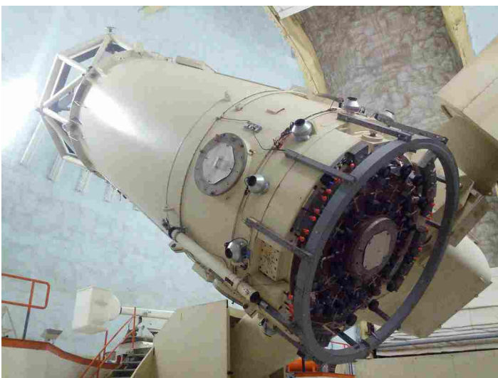
The telescope inside the dome