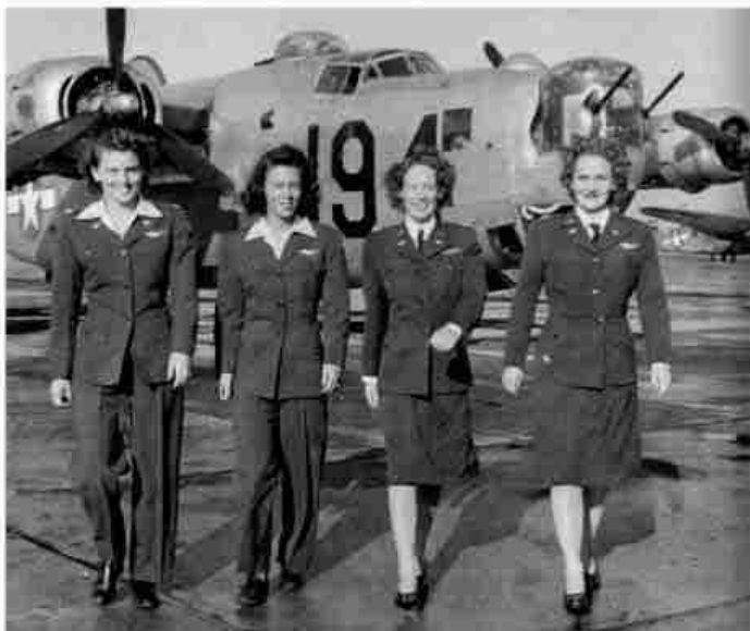
Women's Service Pilots were featured