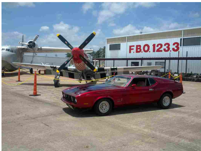
Ford Mach1 & a near Mach1 P-51

That's right—Saturday--the same day as "Date Night"--from 11:00am until ?? They celebrated 20 years since the catastrophe when General's hangar burned down and consumed all the war birds in it. The day included antique and classic cars, warbirds, barbeque lunch under the new shade, and a retro swing band playing old time favorites & requests.