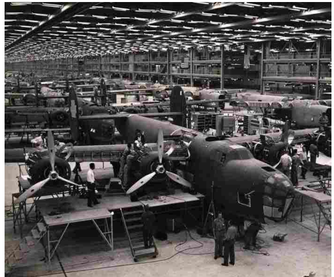
B-24s in production at Willow Run