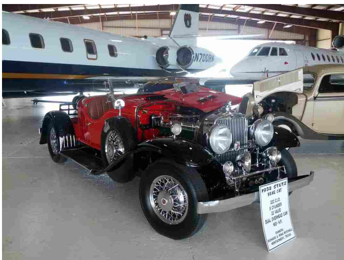
A 1932 Stutz Bearcat