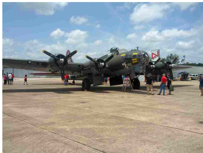
Texas Raider gave rides & tours