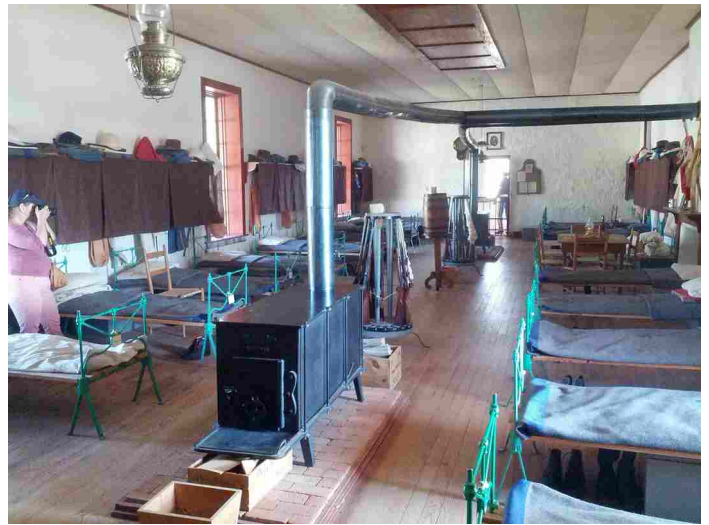
"Buffalo Soldiers" barracks