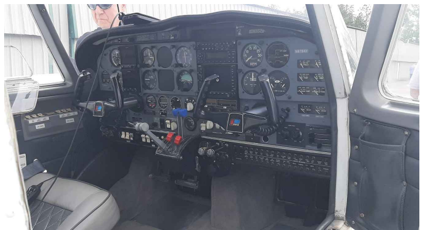
Enough buttons & levers to keep Darryl busy for some time