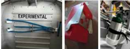
Pedal Extender Oxi Tank Mount