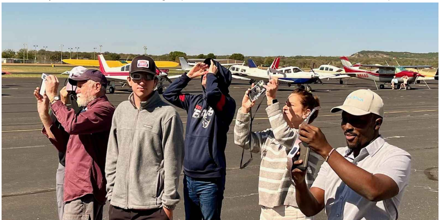
The Fredericksburg group were the clear winners—with clear skies and good views