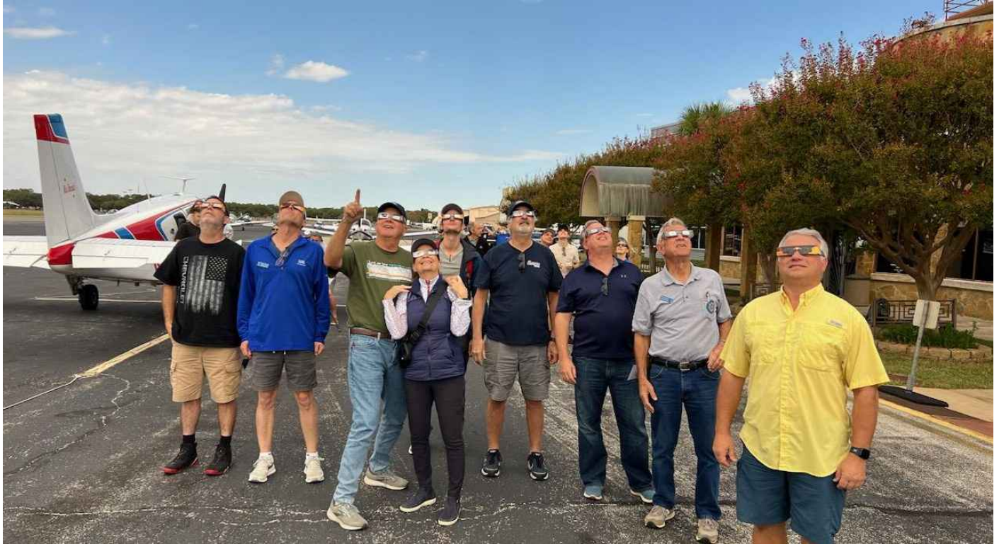
As you can see, the Stinson group had some broken clouds but still saw the eclipse

There are no minutes, as the 14 th was switched to a short briefing and then a flight to Mustang Beach Airport and join a NASA group observing the Annular Eclipse. A last minute call indicated that Port Aransas was overcast. The group then split up, with half going to San Antonio's Stinson Field and the other half going to Fredericksburg.