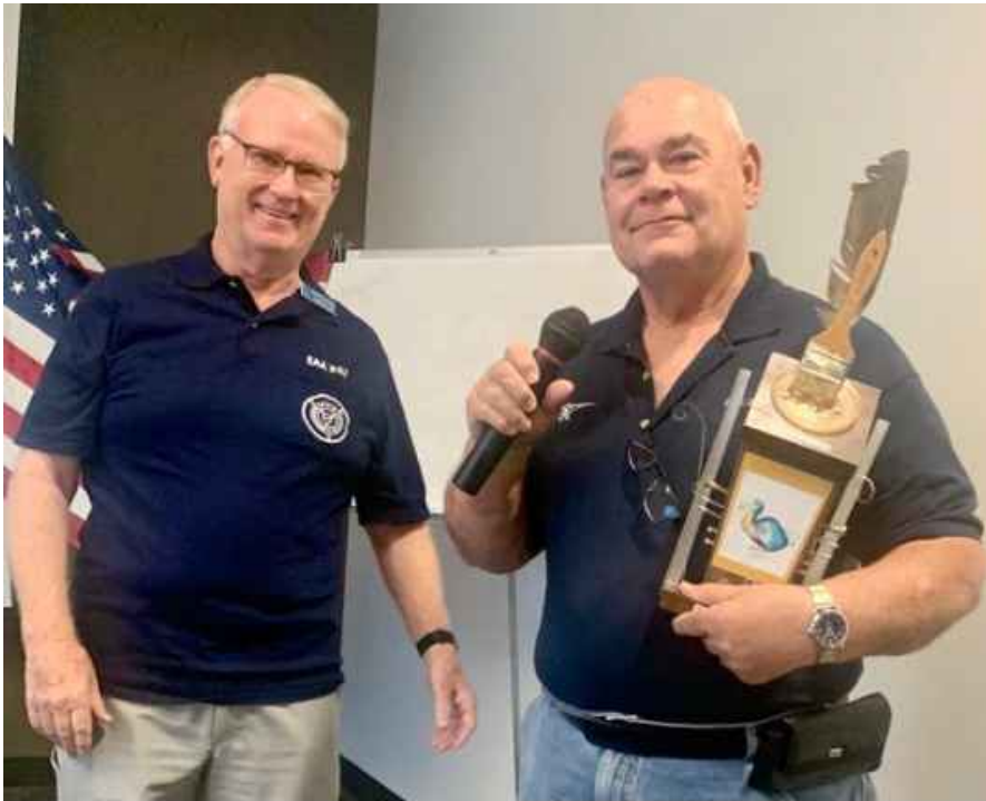
Glad to see that Trophy change hands

If you've never heard of it, the Dodo Award is a traveling trophy that is given to a person who takes a flying airplane and grounds it (or makes it extinct).