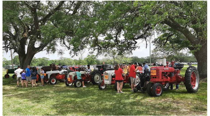
Antique Tractors & hit/miss engines