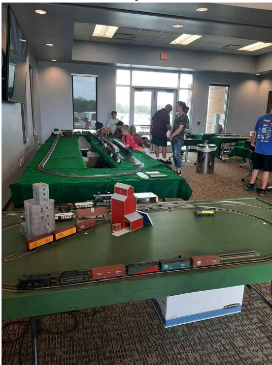
Working train sets for the kids