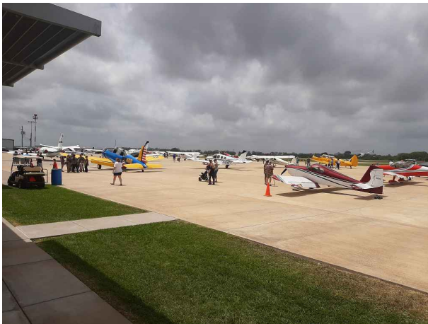
Over 60 fly-in aircraft