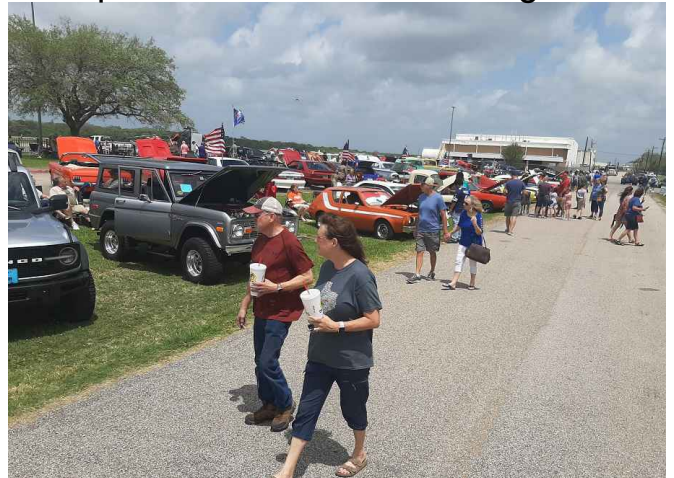
Antique & Classic Car Show