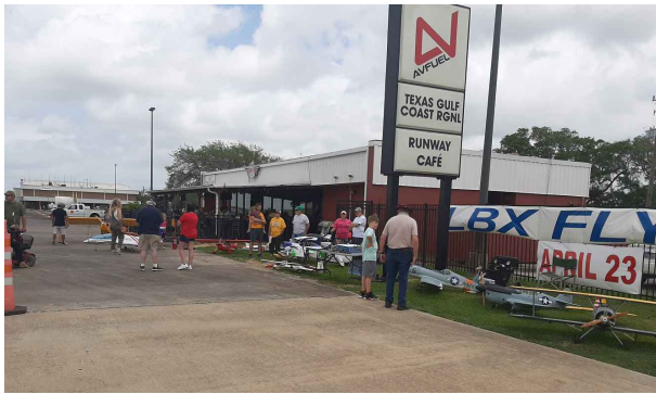
R/C aircraft air & ground displays

If you didn't make this flyout, you missed a good one. Make sure to make plans to attend the Smithville Fly-In on the following page.