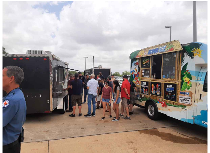
Food trucks and Runway Cafe were BUSY