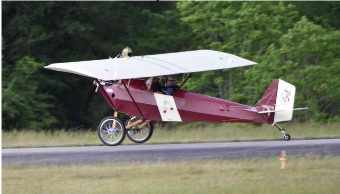
Blazing down the Runway