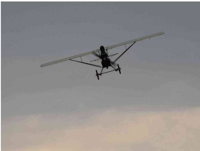
Not much forward visibility on final