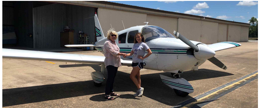
Newly minted Instrument Pilot—May 4 th , 2019