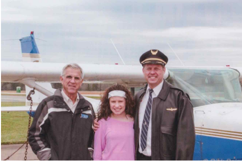
First Young Eagle Ride-2015