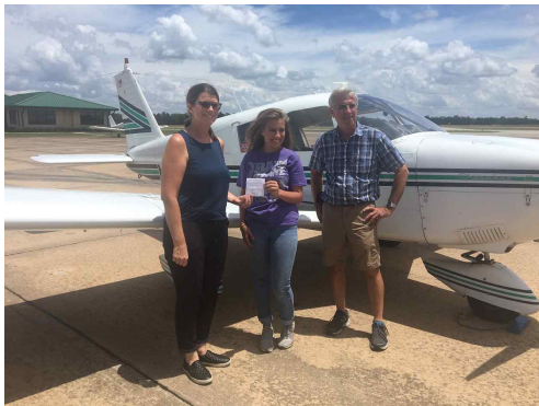
Private Pilot on 17 th Birthday