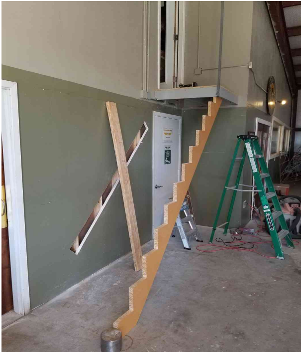
Platform built, suspended, door cut in. Studs located, put in nailer for stringer.