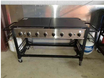
6 Burner BBQ