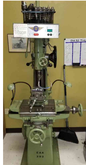
Jig Bore (Mill) With tools