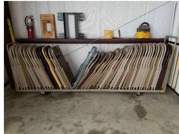
50+ Chairs with dolly