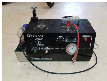
Plug Cleaner/Tester & tools