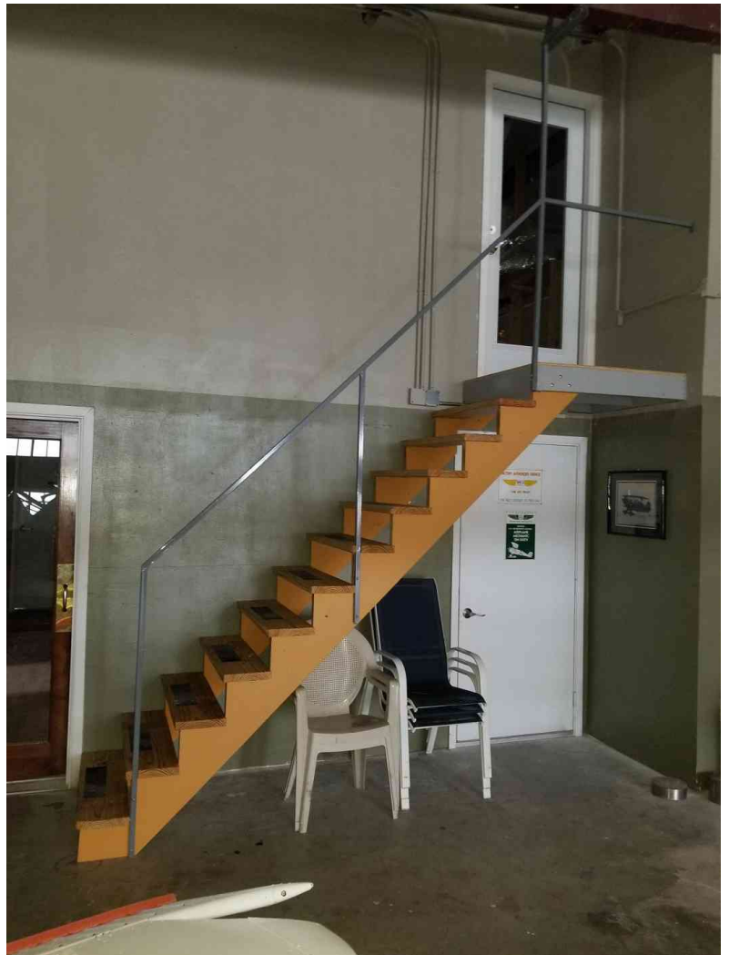
Completed project with treads, antiskid, door trim, Bannister welded and painted.

Now you can find all the Pancake Breakfast serving items, Young Eagles signs, chocks, safety vests, banners—you name it. Don't forget the newly acquired dispenser for ashes dispersal.