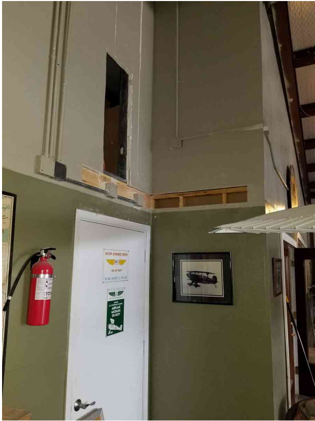
Electrical conduits moved, sheetrock removed, floor joists located