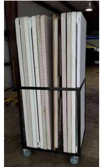
12 Tables & dolly